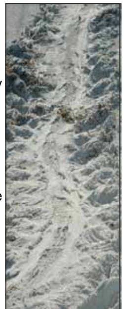
Female Loggerhead Tracks

Information for this article was obtained from myfwc.com/research/wildlife/sea-turtles and www.conserveturtles.org .