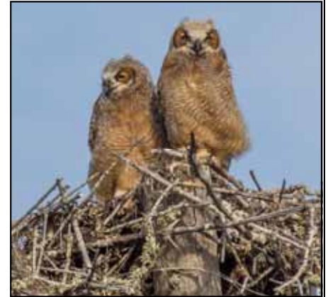
Great Horned Owlets at Stump Pass Beach State Park

warmhearted memories of many and will miss the interaction with them. However, she is also eager to make the park that she fondly calls "Stumpy," her playground in the future. She lives within two miles of the park and plans on visiting often.