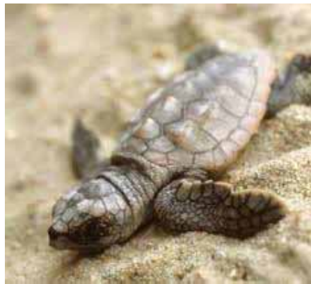
Loggerhead Sea Turtle Hatchling Caretta caretta

The loggerhead sea turtle obtained its name due to its oversized head. Its carapace or outer shell is considered heart shaped and is 2.5 to 3.5 feet in length. The carapace is reddish-brown in color as an adult and dark-brown when it is a hatchling. Flippers which give it the ability to swim well distinguish the sea turtle from a land turtle. Typically, adults weigh between 155 and 375 pounds.