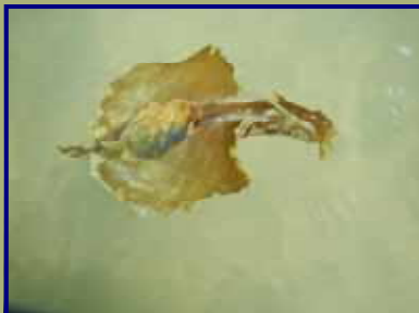
Sea Hare photo taken at a Wading Adventure!

Educational Programs: FREE to BIPS members, $5 per person. Park vehicle fee: $3 per vehicle (not included in program fee). Dates and times are subject to change. Please call (941)964-0060 for reservations or more information.